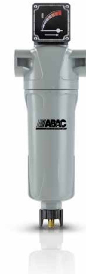
Pressure Conversion Kit